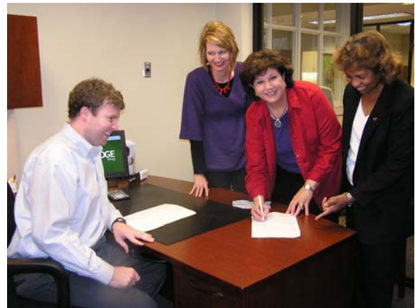
Historic MCIC Moment at Regions